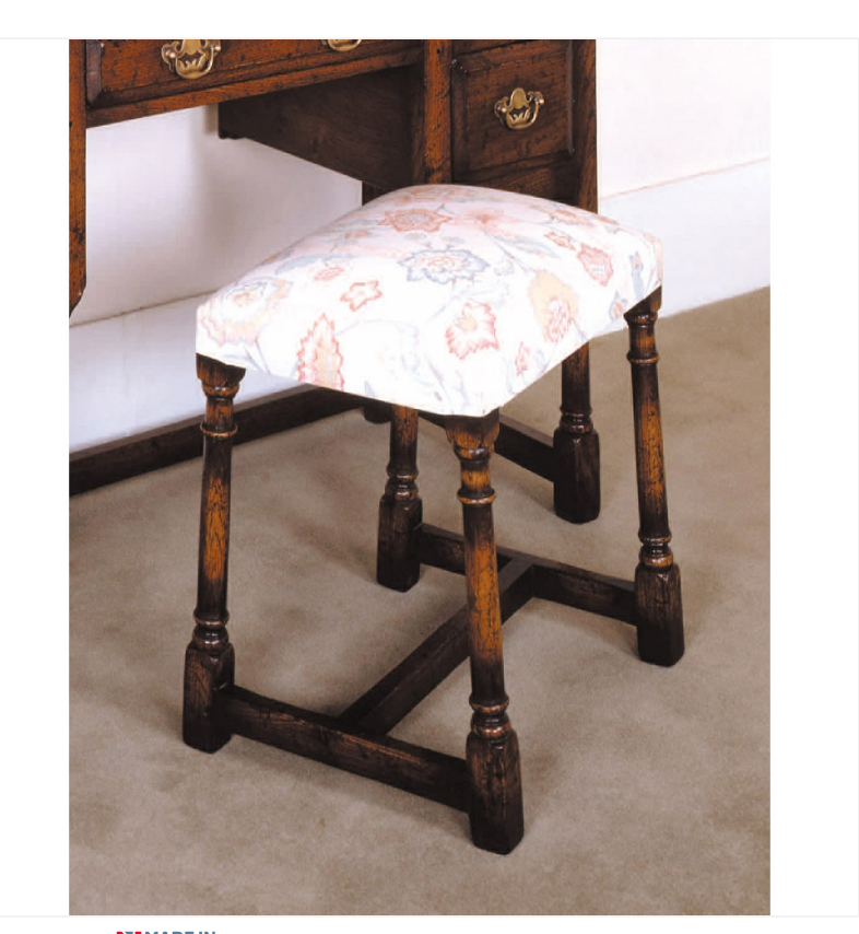
MADE IN Proudly handmade at our workshops in Suffolk, England

An Oak dressing stool, raised upon simple barrelturned splayed legs with an "H" stretcher. This is the companion piece for RL.22971/AS.